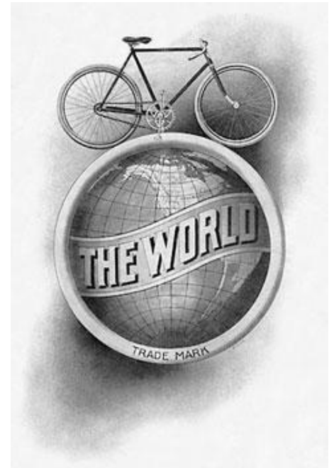
Turn-of-the-century Schwinn ad

Answer: US Citizens need to bring their original birth certificate, or a certified copy. You will also need a government issued photo ID. Current passports are also accepted. Non US citizens need to phone both the Canadian Consulate (716-858-9501) and the US Immigrations office (716-282-3141) to find out what type of documentation is needed. These regulations are frequently changing. To get the latest - visit the INS web site. INS Website Entry into Canada & USA http://www.uscis.gov/graphics/index.htm